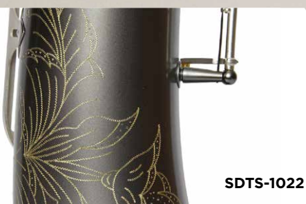
Ergonomic key design coupled with "low profile" key cups offer fast, smooth & articulate key action.